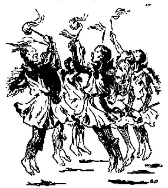
The war dance of the young men of the Kikuyu tribe in Africa provided the inspiration for the Scout's "war dance".

They then form into a wide circle, into the centre of which one steps forward and carries out a war dance, representing how he tracked and fought with one of his enemies. He goes through the